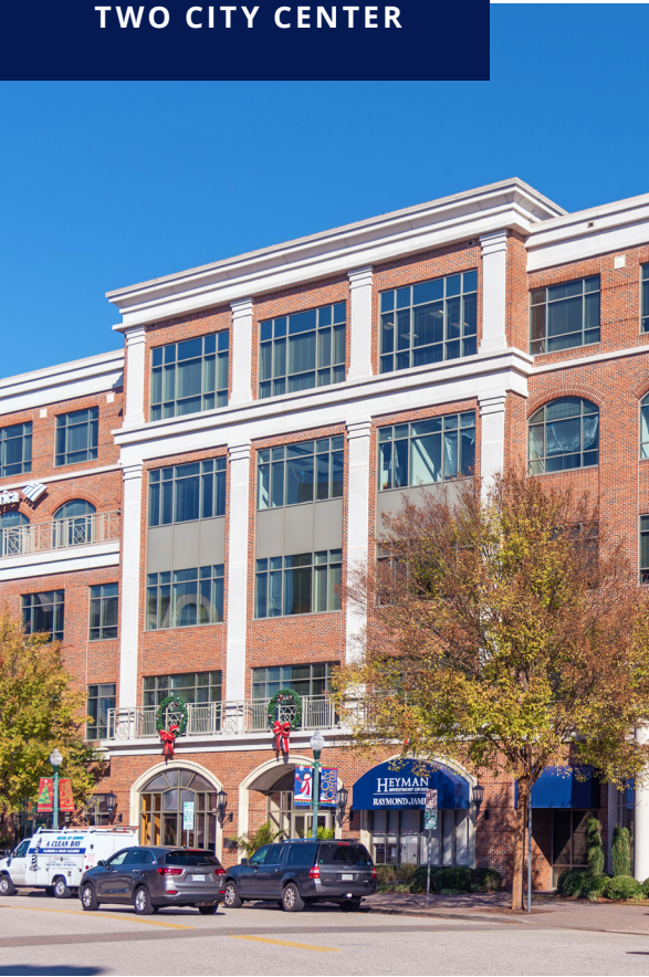
Suite 210: 2,030 RSF